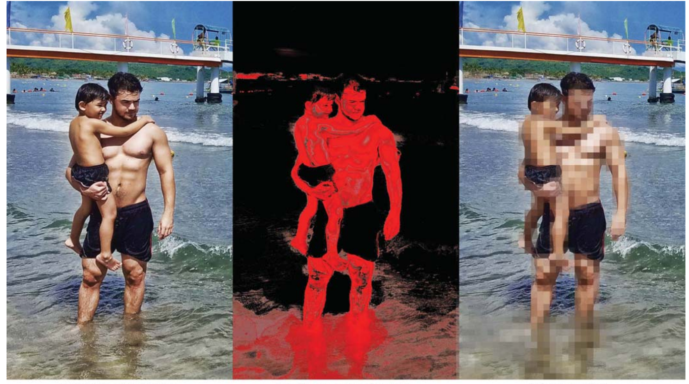
(A) Sample Input Image

In a programming perspective, these rules will be part of the conditional expressions to allow the application to decide on its own whether certain media files (images and video frames) contain nudity or not. If the conditions of nudity are met, then the multimedia file will be classified as such.