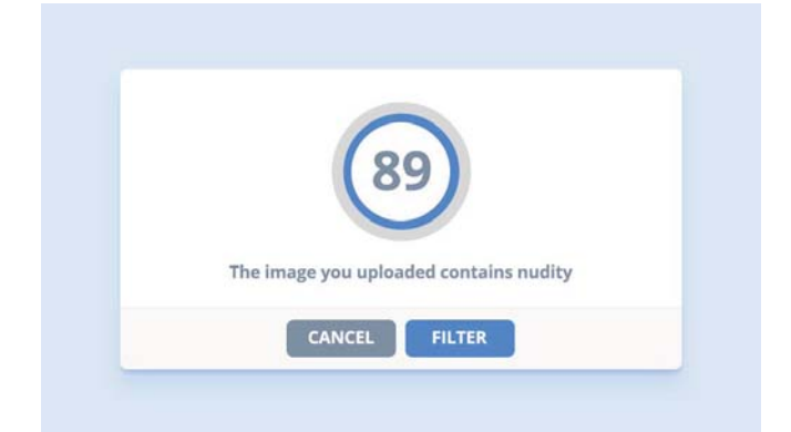
Fig. 5. Notification modal showing the nudity probability.