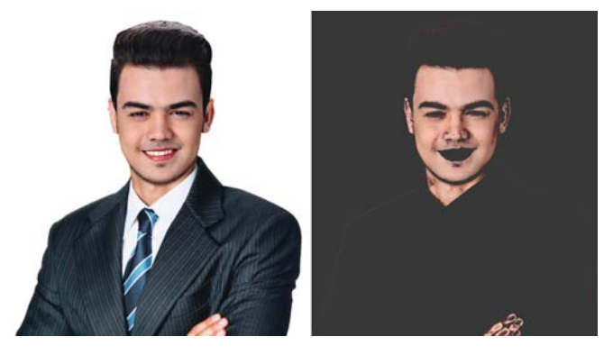
Fig. 1. Sample visualization of the colored-skin detection.

While RGB color space has been successfully used to detect skin in a still frame [3] for nudity classification, a more updated research used YCbCr [7] because redundancy of its channels is much lower compared to RGB. Statistically speaking, YCbCr is more superior to any other color spaces [8] and can be obtained via a linear transformation from RGB format. Grounded on these results, the goal of the skin detection stage is to eliminate other regions of the image and still frame that are not considered human skin. As discussed in [7], using the traditional idea of spatial analysis such as generation of seed and propagation will be very vital in the skin detection. Since their proposed algorithm outperformed other methods, their framework was used as the inspiration when building the system architecture of this study.