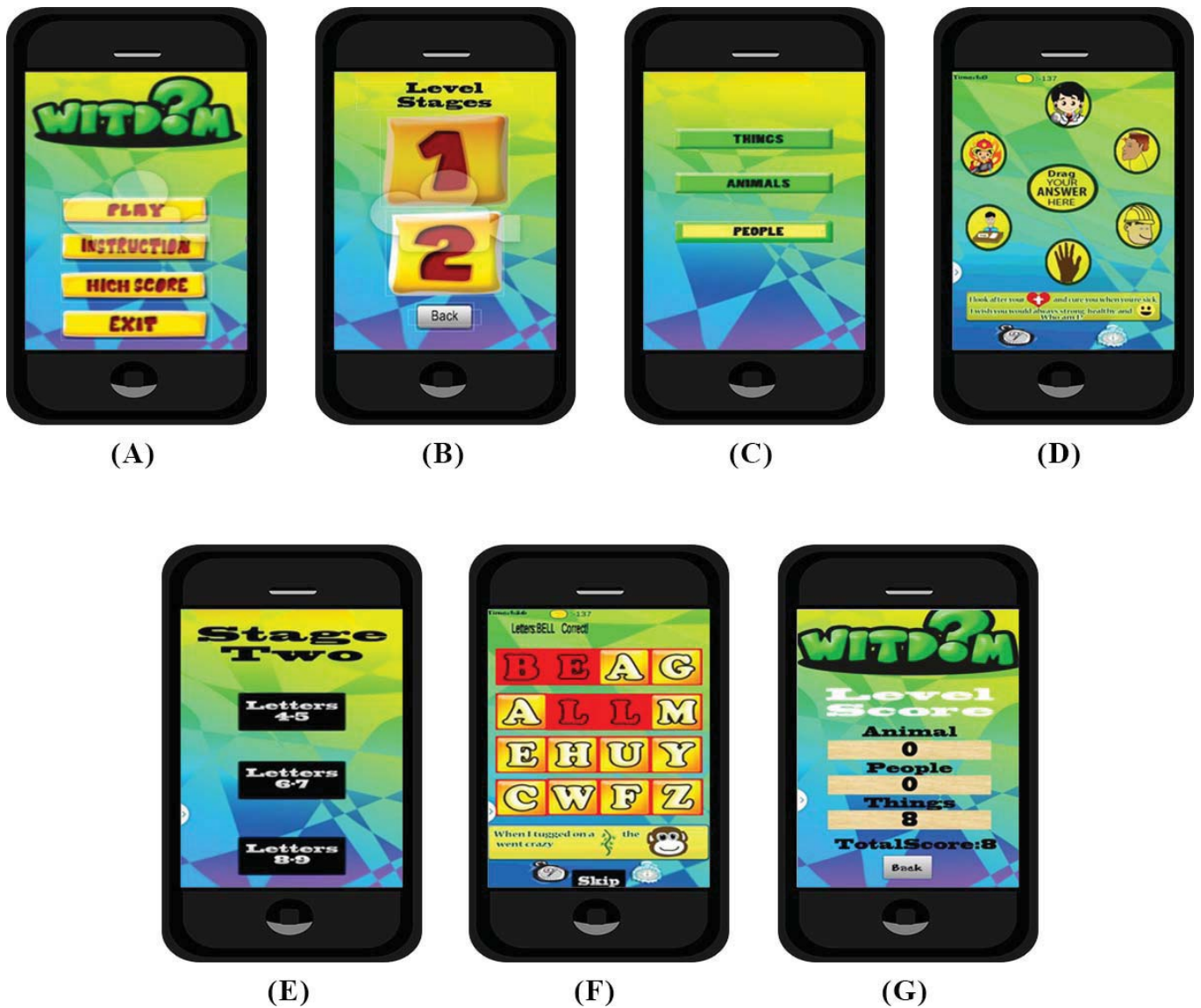
Fig. 2. Presentation of the logical guessing riddle mobile game application using Fisher Yates Algorithm. Screenshots shown are the following: (A) Main screen of the logical guessing game; (B) Game levels selection; (C) Game categories per each level; (D) Game Level Interface with timer and coins counter; (E) Game Categories of Level 2 with specific numbers of letters ; (F) Gameplay interface of Level 2; and (G) Gameplay evaluation per category.

The figure 2(A) shows the main screen of the game application, there are different buttons; the “Play” button where in the users will be able to start the game, the “Instruction” button where in the users can be read how the game will play and what is the goal of the game, the “High Score” button where the users can be able to see what is the highest score, and “Exit” button where the users can closed the game if they are already finish playing it, all buttons will lead you to different pages. On the other hand, the figure 2(B) shows that there are two levels that will lead the users to two different screens. If the users will click the “1” button, it will lead them to the screen of the categories (things, animals and people) of level1. If the users will click the “2” button, it will go directly to the screen of the categories (letters from 4-5, 6-7, 8-9) of level 2. These two level has a different concept of answering the riddle. The figure 2(C) shows the three categories of level 1; things, animals and people. There will be a randomize selection on these categories. These categories have an animation for choosing one of them. The animation of these is all the categories going up and down. The figure 2(D) shows the interface of level one which has a timer in the upper left of the interface