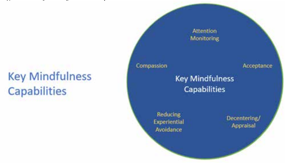
Figure 2. Key Mindfulness Capabilities