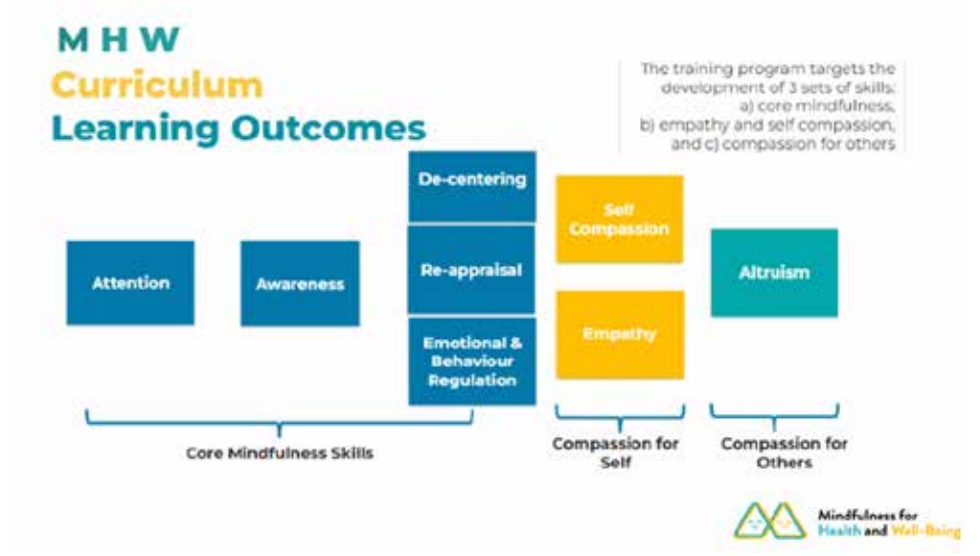
Figure 4. MHW Learning Objectives develop core mindfulness skills in Sessions 1 to 8 and compassion in Sessions 9 to 12

Unlike most mindfulness programs that are delivered between 6 to 8 sessions, teaching and learning MHW in a college context entails patience and perseverance. MHW learning objectives (Figure 4) lays out the skills that the program desires to develop. Utilizing a scaffolded and experiential approach, each session serves as a foundation for the succeeding ones and students learn skills one step at a time. This incremental approach allows for the practices to develop into skills, often the degree of learning and change is commensurate to the commitment to practice and observe. Those who have really committed to attending sessions and doing their home practices are more aware of the changes in their reactivity, their internal processes and the impact on their behavior and interactions.